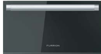
Optional: Drawer Front (Black with Silver Handle) CF1SL02ABLA1