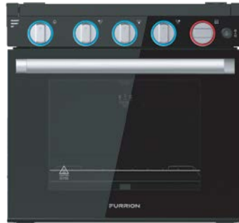
FGR21G3A2-BG (Black with Silver Handle)