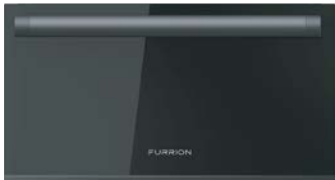
Optional: Drawer Front (Black with Black Handle) CF1SL03ABLA1