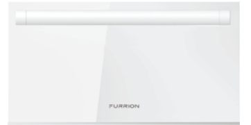
Optional: Drawer Front (White) CFGR17G3A1-PG