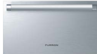
Optional: Drawer Front (Stainless Steel) CF1SL02ASSA1