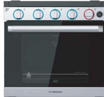
FGR21G3A1-SG (Stainless Steel)